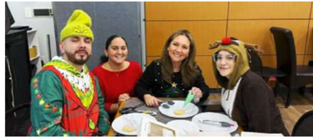
A Halloween costume competition